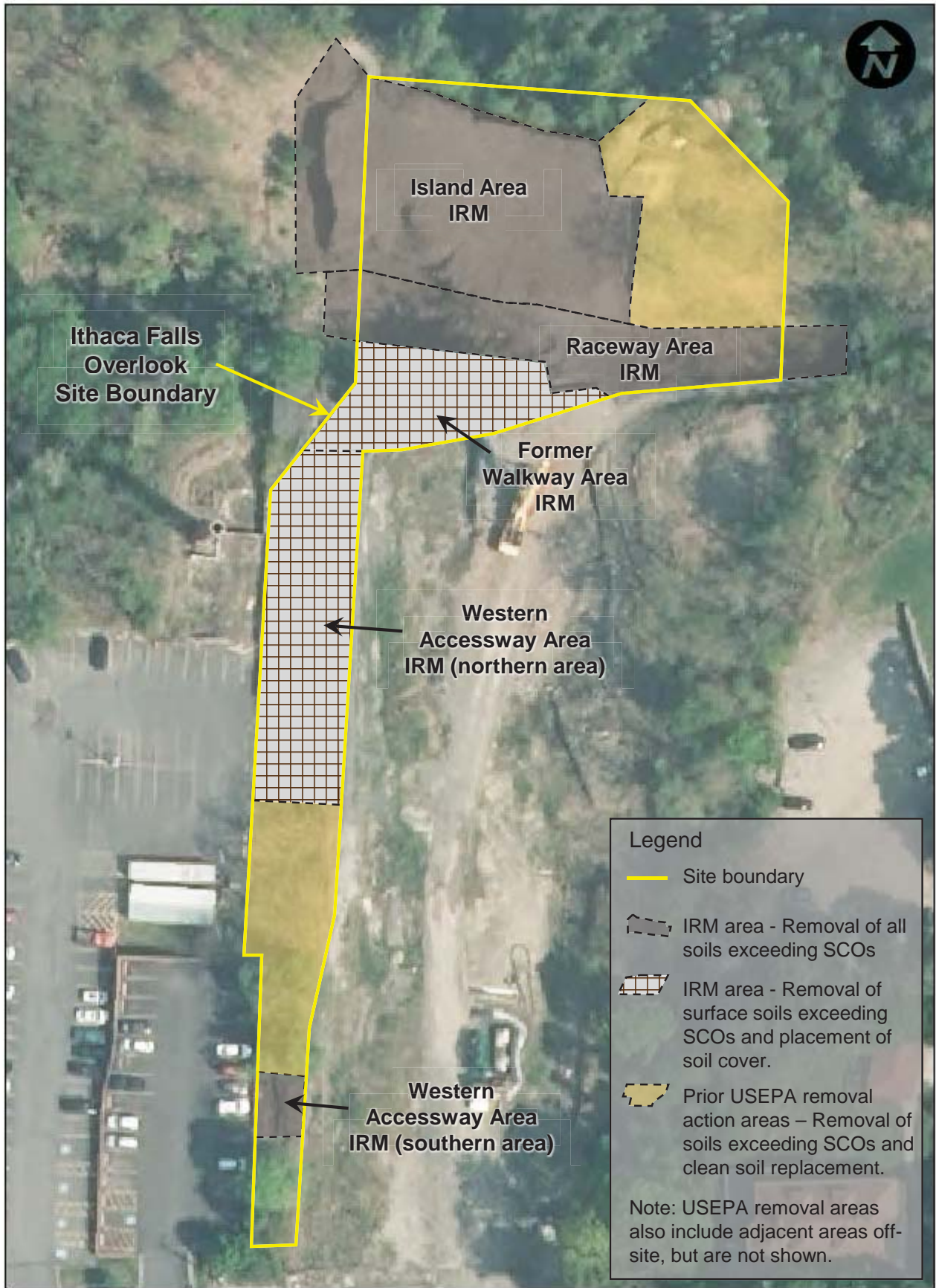
FIGURE 4 – IRM AREAS Ithaca Falls Overlook, E755018 City of Ithaca, Tompkins County