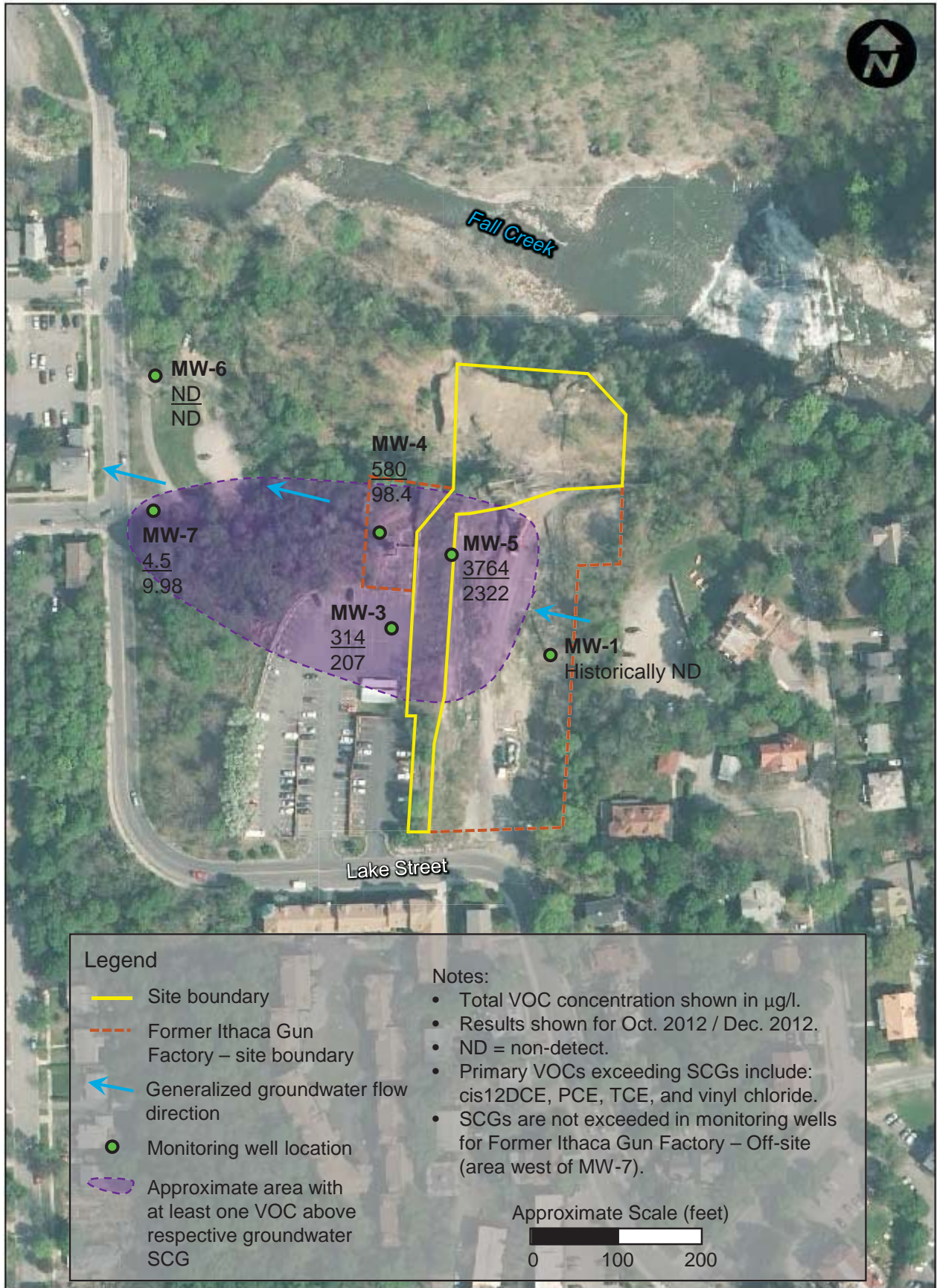
FIGURE 3 – GROUNDWATER VOC DISTRIBUTION Ithaca Falls Overlook, E755018 City of Ithaca, Tompkins County