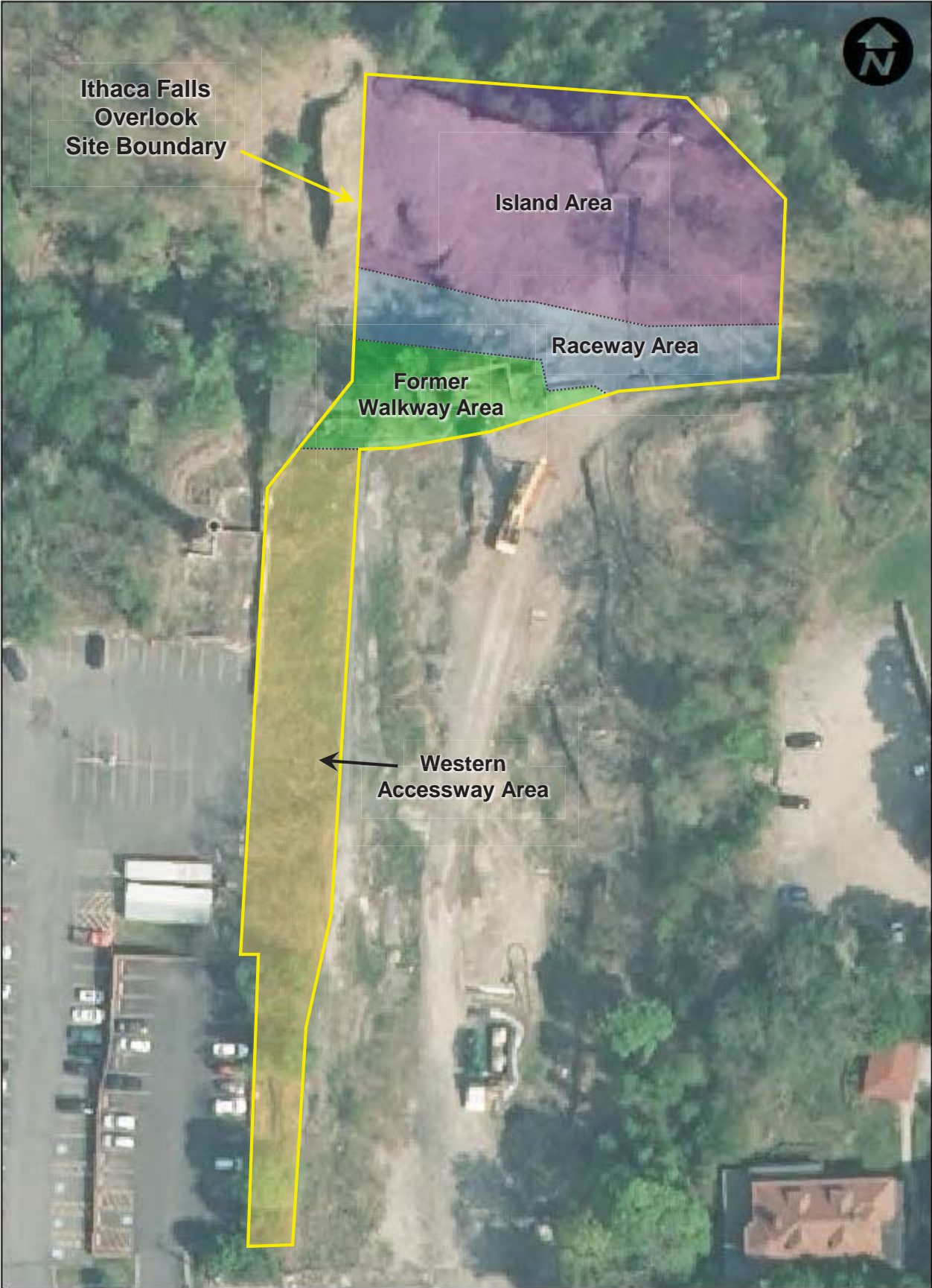
FIGURE 2 – SITE AREAS Ithaca Falls Overlook, E755018 City of Ithaca, Tompkins County