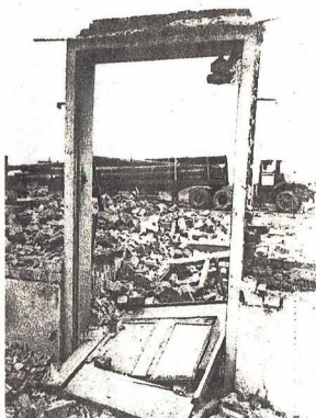
TOP: The former Morse Industrial Corp., presently owned by Emerson Electric, in Ithaca. TCE contamination has spread into neighborhoods north and west of the factory. BOTTOM: Demolition of the polluted Remington Rand factory cleared the way for the Elmira High School in the late 1970s.

Saturday $1.50 0 40901 03815 3 Home delivery pricing inside Subscribe 866-254-3068